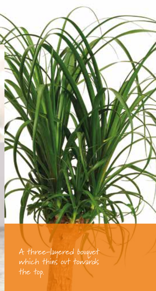
A three-layered bouquet which thins out towards the top.