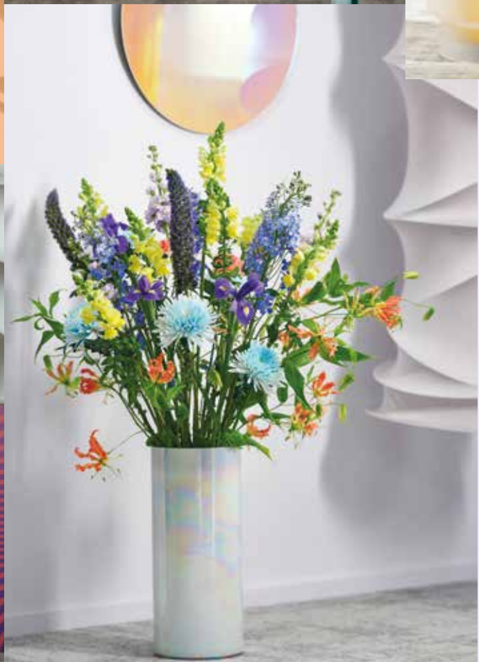
Striking, contrasting colours bring energy.