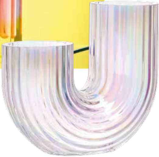
Iridescent effects on glass.